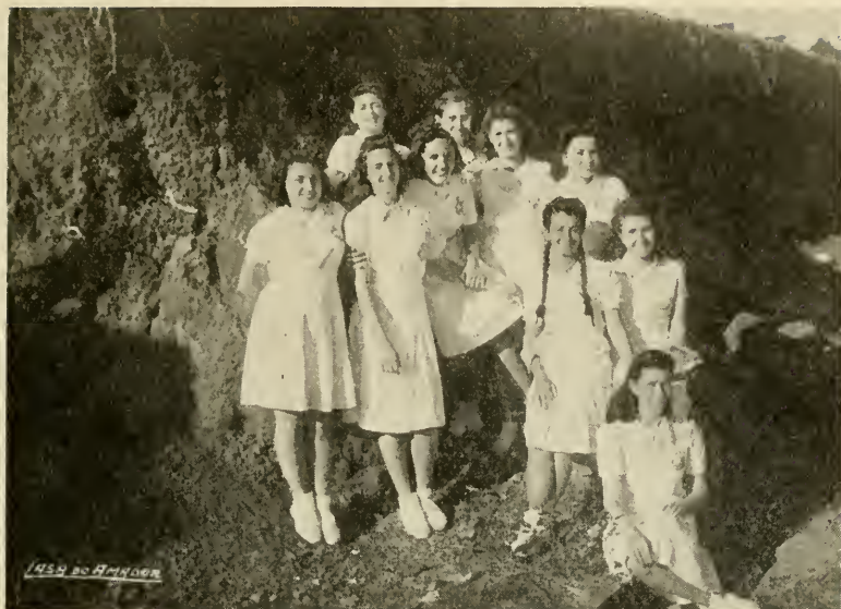
A long-to-be-remembered outing for seniors at Colegio Americano, Porto Alegre